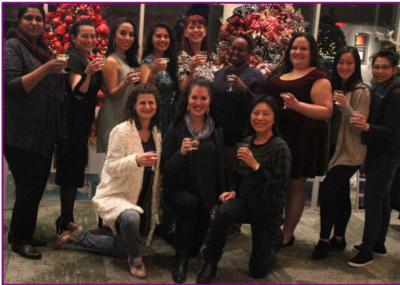
The Inaugural RCB Alumni Cocktail Reception in the Theatre Lobby